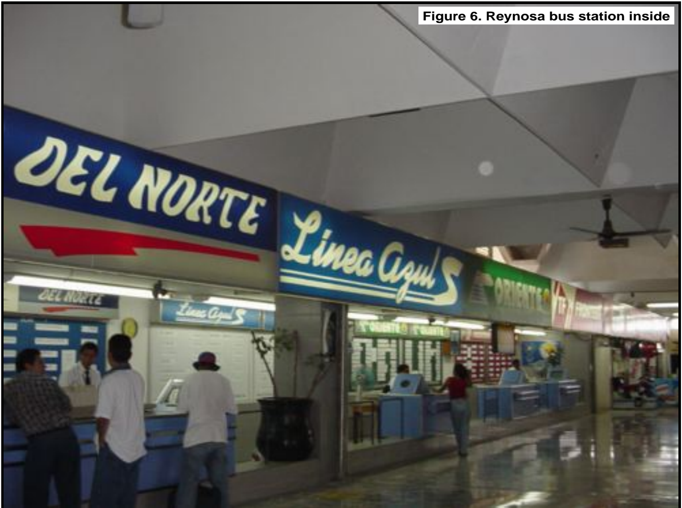
Figure 6. Reynosa bus station inside