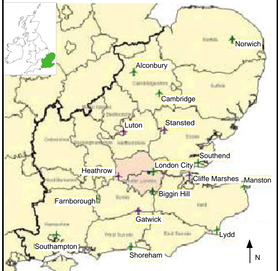
Figure 1. Airports & potential airport sites identified in the South-east England aviation consultation

Emission charges could be added to the existing Air Passenger Duty. In addition to generating extra revenue for the Treasury, they would provide extra flexibility to policy makers. For example, the charges on night time departures and landings could be sufficiently high to discourage them. If night time movements decreased, the extra charges would be very popular. If the official econometric estimates of price elasticities are wrong and night time movements are not reduced, then the extra revenue could be used to increase the grants by the Central Government to local authorities surrounding the airports, thereby providing some compensation for aircraft nuisance through lower Council Taxes. The introduction of emission charges appears to be a win-win policy which all governments are likely to find attractive. The official forecasters may well be wrong in ruling out the equalisation of the indirect tax burden across different transport sectors. Their forecasts of future traffic are extremely important because they have such a large effect on estimated future capacity requirements. If they overestimate future traffic by a substantial amount, because new airport charges are introduced, seriously wrong investment decisions will be made.