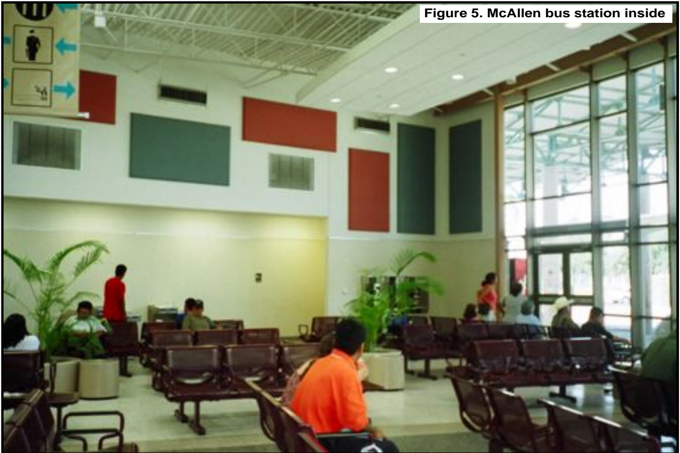
Figure 5. McAllen bus station inside