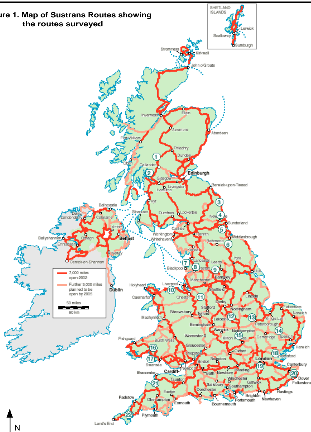
Figure 1. Map of Sustrans Routes showing the routes surveyed